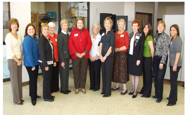
The Staff of Literacy Suffolk