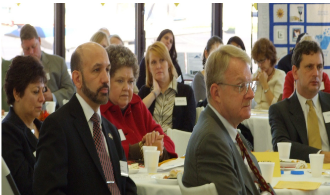
Guests listen intently to the panel discussion.

Literacy Suffolk and Literacy Nassau continue to work with and seek out new and effective ways of bridging the gap between health care providers and the low literate population requiring their services.